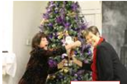
A fight for the only Santa!